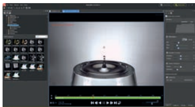
Comprehensive editing- and export function of the recorded sequence with Imaging Studio v4 MovieSuite