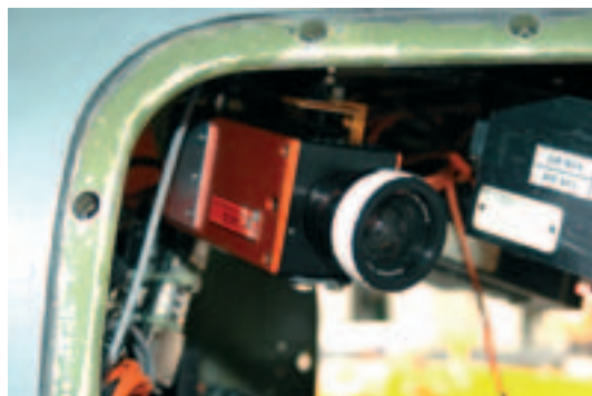
S-EM positioned inside pod