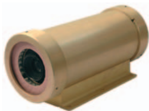
Airborne housing for S-EM

Selectable ROI – the customer can select the most suitable image format (ROI, region of interest) almost without limitations, for best camera performance and image quality