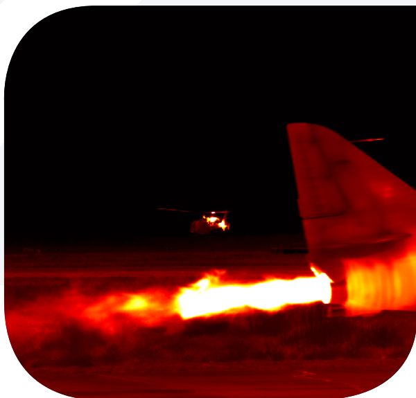
Jet Engine IR Signature Measurement