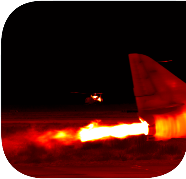
Jet Engine IR Signature Measurement