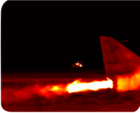
Jet Engine IR Signature Measurement