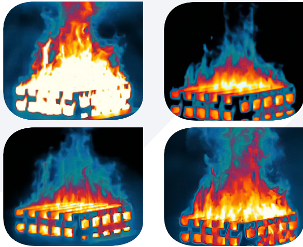
Multispectral image of burning wood crib