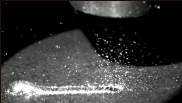
Additive manufacturing – Laser welding