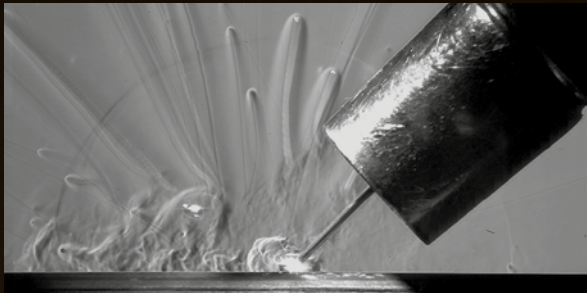
Schlieren imaging of arc welding – With front-illumination