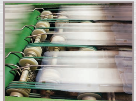
• Processing of cellulose products (Disposable nappies, napkins, tissues, kitchen roll etc.)