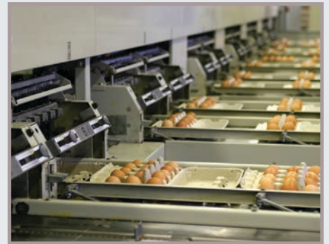
• Processing of food