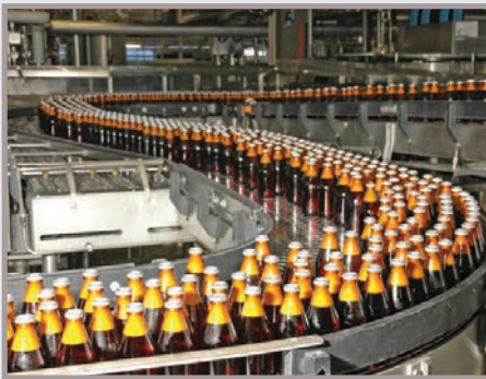
• Bottling of beverages

such as paper nappies (diapers), napkins and paper handkerchiefs. Manufactured and packed at the highest cycle rates, PROMON can document all these processes in exact detail, picture by picture.