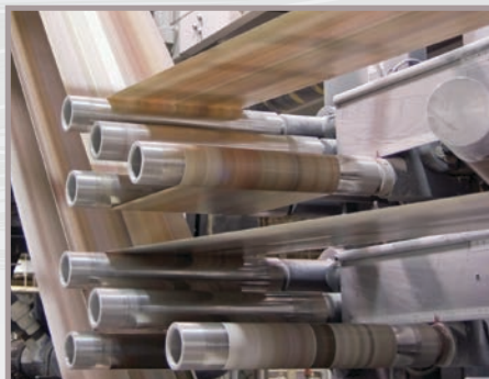
• Surface Inspection • Web-based products like paper and foil webs, plastic film, fabrics etc