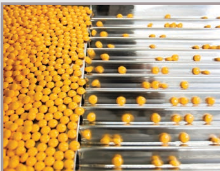
• Packing pharmaceutical products