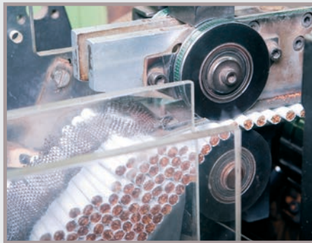
• Packaging of goods