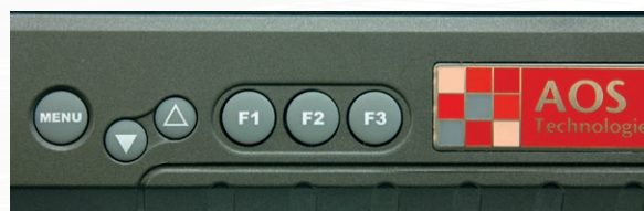
Dedicated control buttons for quick access to menu, exposure time, and user-specific camera settings.